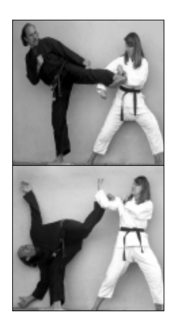
By contemplating Li , you will discover many hidden variations. Here is a takedown possibility within a blocking motion.

Spiritually evolved martial artists do everything they can to avoid petty fighting. By developing a strong character, they are not easily drawn into fights. The principle of defense is to prevent harm to themselves and others, thereby preserving harmony. This strong sense of benevolence and justice are the guiding principles for the martial artist in action.