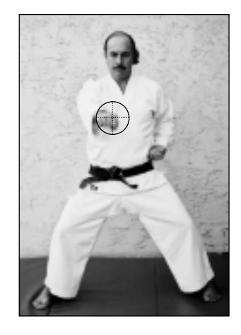
THE PUNCH COMES FROM THE CENTER TO MAXIMIZE POWER.

There are many different techniques to be learned, each with varied possibilities for application. For example, a back stance has a different balance point than a front stance. An upper target punch is centered differently from a lower target punch. Yet all techniques share in a common central principle: chung . Discover it and stay close to it. For example, beginners make the mistake of punching out from the shoulder, but to the side, away from their centerline. As a result, the potential power that can be generated from the whole body is lost. The punch simply comes from the arm and shoulder, resulting in a much weaker technique. Your personal best must include all that you are, your whole body, working in balanced unity, for maximum power, agility, and speed.