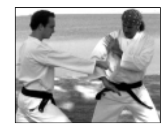
CONTEMPLATE THE MOTION OF ONE OF THE MOVES IN A PRACTICE ROUTINE, SUCH A KNIFE-EDGE BLOCK. HIDDEN IN THE BLOCK, THE MOVE WITHIN THE MOVE, IS A SOFT BLOCK.